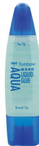
Tombow MONO Aqua Liquid Glue with blue cap

Try to avoid getting this basic X-acto knife.